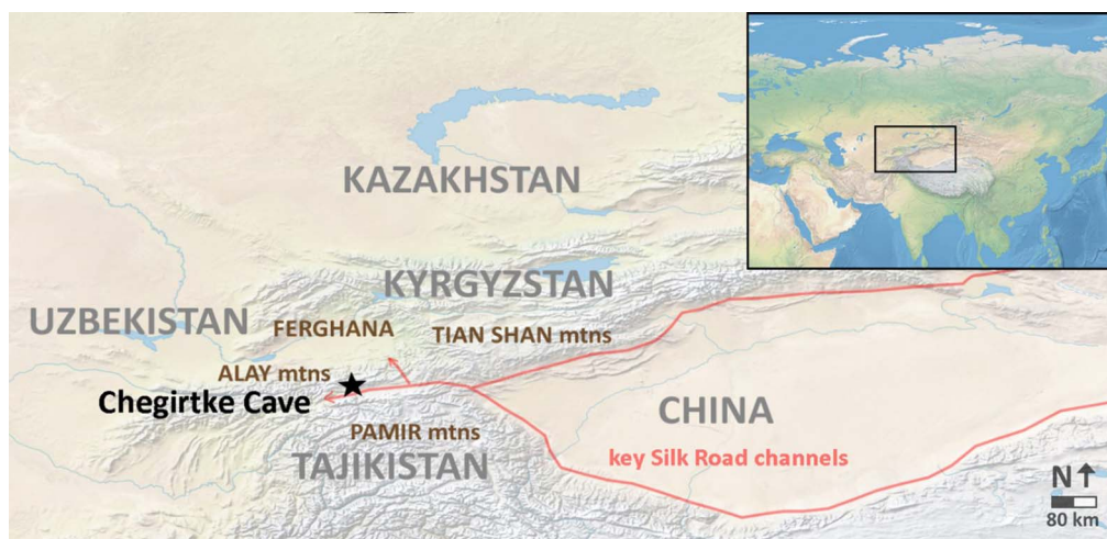
Figure 3. Location of Chegirtke Cave, within the Alay Valley, along with the approximate location of some key branches of the Silk Road, and other important political and geographic locations mentioned in the text (map by W. Taylor).

remains are available with which to understand animal economies prior to the first millennium BC.