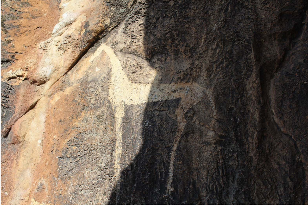
Figure 1. Iron Age horse petroglyph in the Ferghana Valley near Osh, Kyrgyzstan, showing the tall stature associated with the famed 'heavenly horses'.