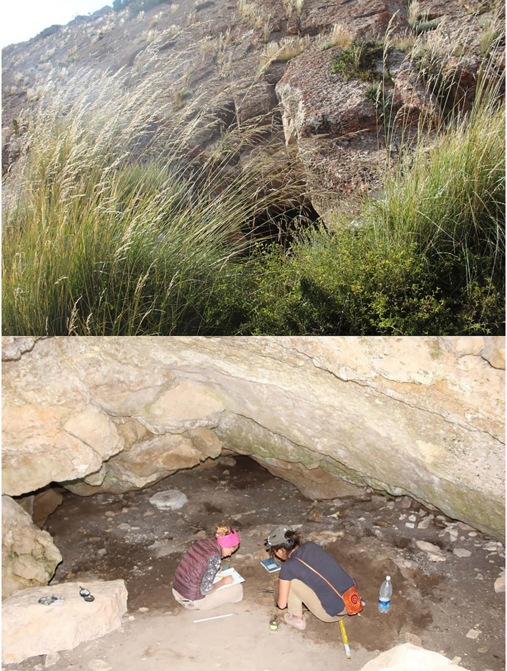
Figure 4. Top) exterior entrance to Chegirtke Cave; bottom) researchers preparing for test excavations within one of the cave's two chambers.